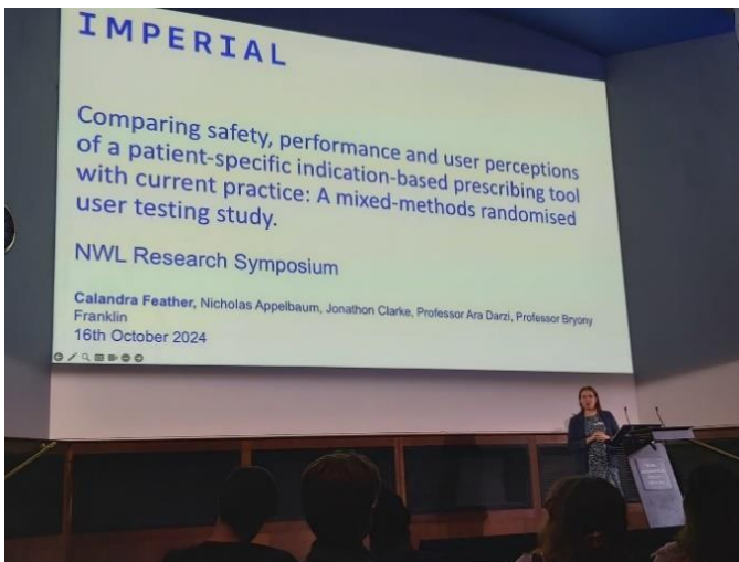
Cally Feather presenting her winning presentation at the North West London NMAHPPS Research Symposium, October 2024.