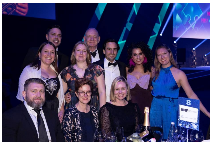
The Touchdose team at the HSJ partnerships awards 2025

We are proud to share the news that West London Children's Healthcare, the integrated paediatric services of ICHT and Chelsea and Westminster Hospital NHS Foundation Trust, received High Commendation in the category of Most Effective Contribution to Clinical Redesign at the 2025 Health Services Journal Partnership Awards. The commendation recognised their partnership with Dosium and the Royal Pharmaceutical Society for the development and implementation of Touchdose, an innovative, paediatric-specific, indication-based clinical decision support tool. Being recognised in such a competitive category highlights the impact of this collaboration in improving prescribing safety and redesigning clinical practice through digital innovation.