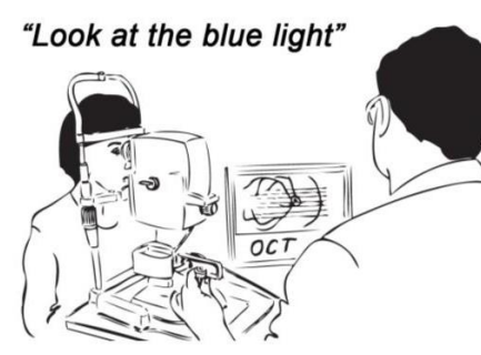
OCT (optical coherence tomography) scan of your optic nerve

Your visit to the glaucoma clinic may last 4 hours. During this time, you will be seen by different members of the glaucoma clinic team. This leaflet shows you some of the tests they will do during your visit.