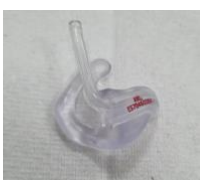
Allow your ear mould to fully dry before re-attaching, perhaps overnight. If there is water in the tubing you may not be able to hear well.