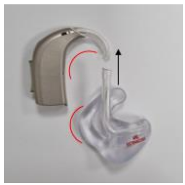
Re-attach the correct ear mould to your right or left hearing aid, aligning the curve of the hearing aid and ear mould as shown above – squeeze the hearing aid hook into the tube and check it is secured.

Please note that ear moulds can easily get contaminated if you have an ear infection. If you are treating your infection with ear drops or oral antibiotics but the ear mould is not thoroughly disinfected, you might carry on having the infection for a long time or even make it worse.