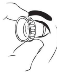
Drainage angle assessment

"Press the button when you see the light"