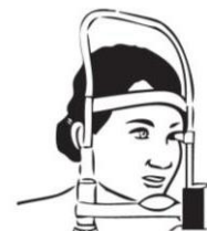
Repeat eye pressure