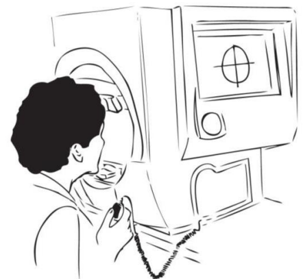
Visual field testing

"Press the button when you see the light"