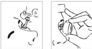
Examination of the back of your eye