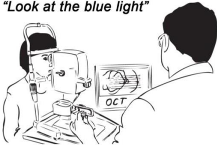
OCT (optical coherence tomography) scan of your optic nerve