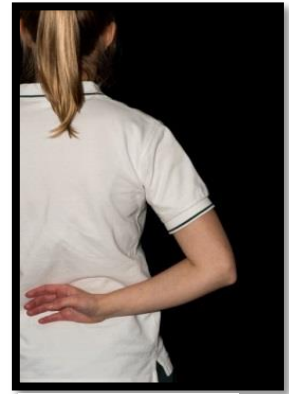
Place your hand behind your back.