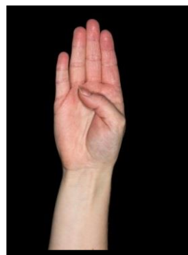
Bend your thumb across your palm and then straighten your thumb.