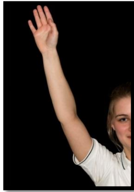
Reach your hand above your head.