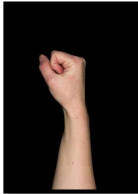
Bend your fingers into a fist. You should be able to make a full fist.