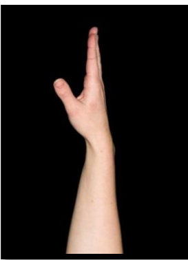
Straighten your fingers as much as possible. You should be able to fully straighten your fingers by this time.