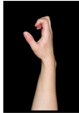
Start with your fingers straight, then bend the tips of your fingers, keeping the large joints straight, forming a 'hook'.