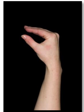
Bend your large knuckles as far as possible, keeping the rest of your fingers straight.