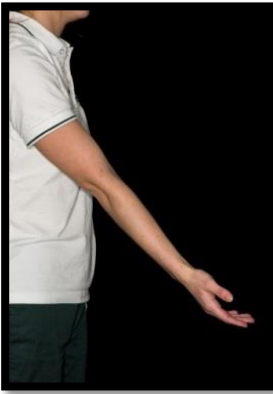
Straighten and then bend your elbow as far as possible.

If you are still having problems with moving your fingers, thumb, elbow or shoulder then we recommend you also complete the following exercises: