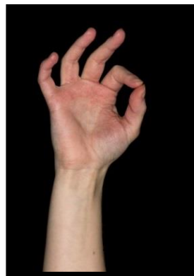
Touch the tip of each finger with your thumb.